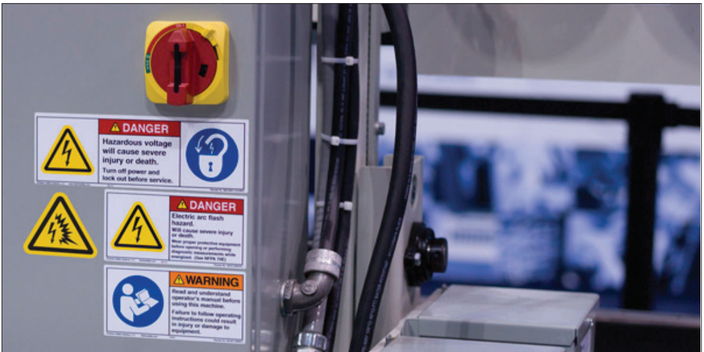
Figure 3: Example of a symbol-only label with the new arc flash symbol placed next to an arc flash safety label (Label designs ©Clarion Safety Systems. All rights reserved.)