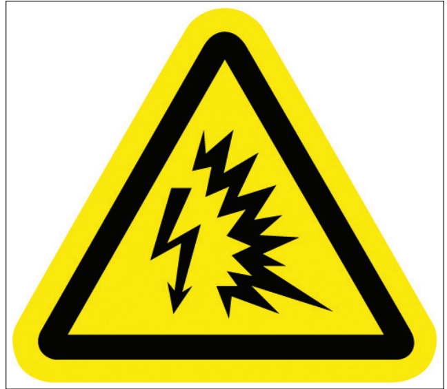
Figure 2: The new ISO 7010 symbol to warn of arc flash that is in the process of being registered

When considering the symbol to use on your labels and signs, choosing a standardized one has many benefits. International use of the same symbol for a given meaning helps to assure consistency. This, in turn, leads to a more efficient understanding of the warning’s meaning by reducing the possibility of unnecessary confusion that could result from the use of varying symbols. For years, the ISO 7010 symbol for “Warning; Electricity” has commonly been used for arc flash. In addition to the 7010 symbol, at Clarion, we’ve also used a symbol to indicate explosion/pressure hazards. See Figure 1. The reason we used two symbols is because there wasn’t a standardized symbol meaning “arc flash explosion hazard” – until now. ISO is in the process of registering a symbol meaning