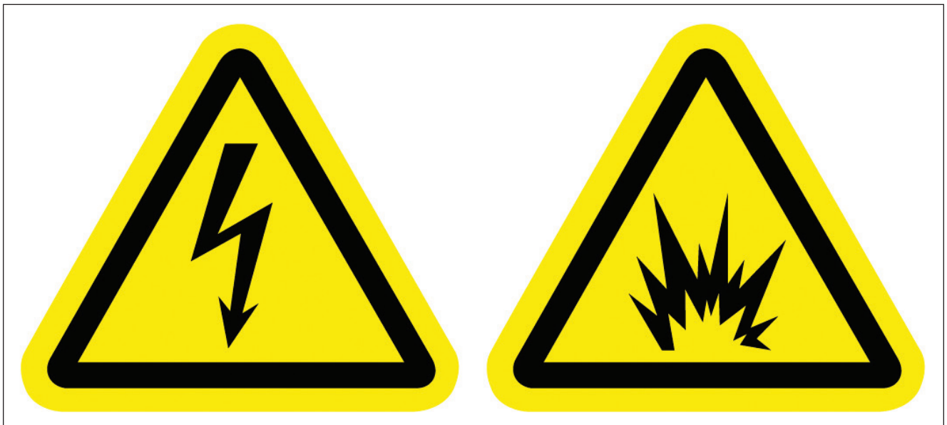
Figure 1: Past symbols used to warn of arc flash. At left, an ISO 7010 symbol meaning “To warn of electricity” and at right, another symbol to warn of explosion/pressure hazards.