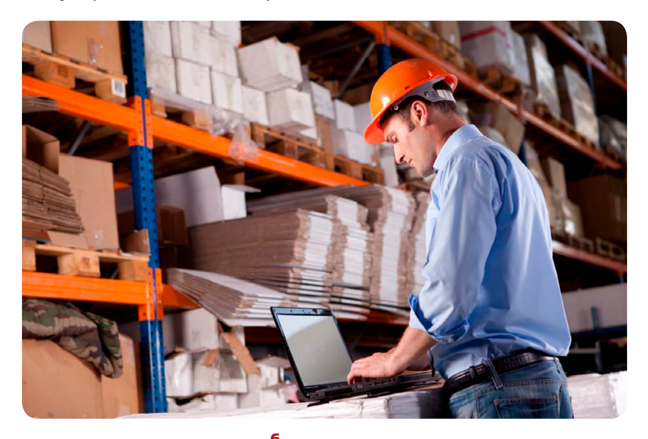
Safely Made www.asse.org 2013

An estimated 5.4% or about 950,000 National Occupational Research Agenda (NORA) manufacturing