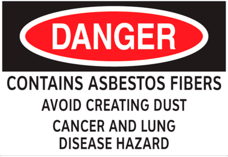
Figure 2 Old OSHA-Style Safety Sign

about hazards and prevent accidents. How do you think the ANSI Z535 standards will be further developed or revised from this point forward, and how do these standards mesh with OSHA's current regulations?